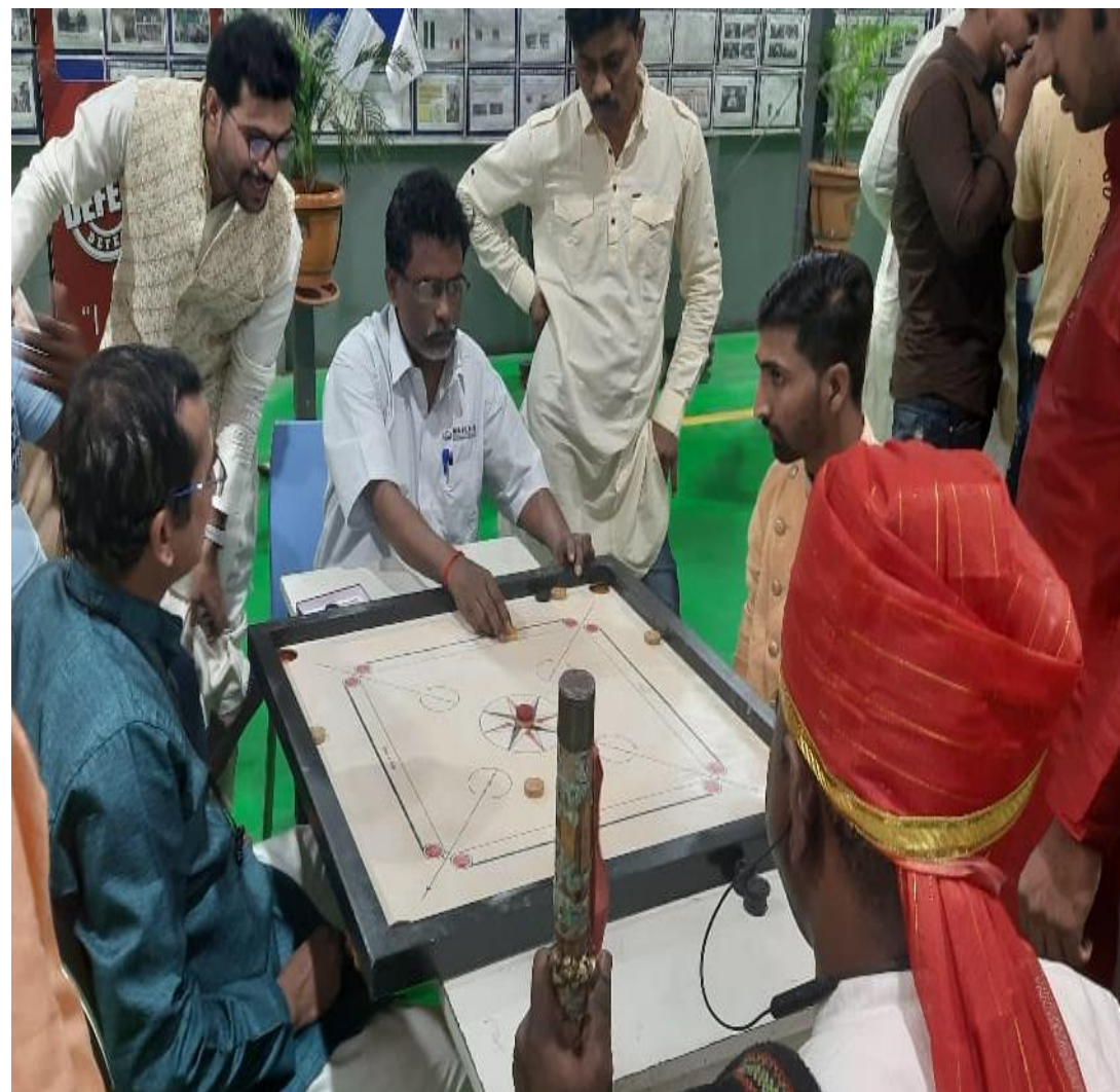
REPL I & VI