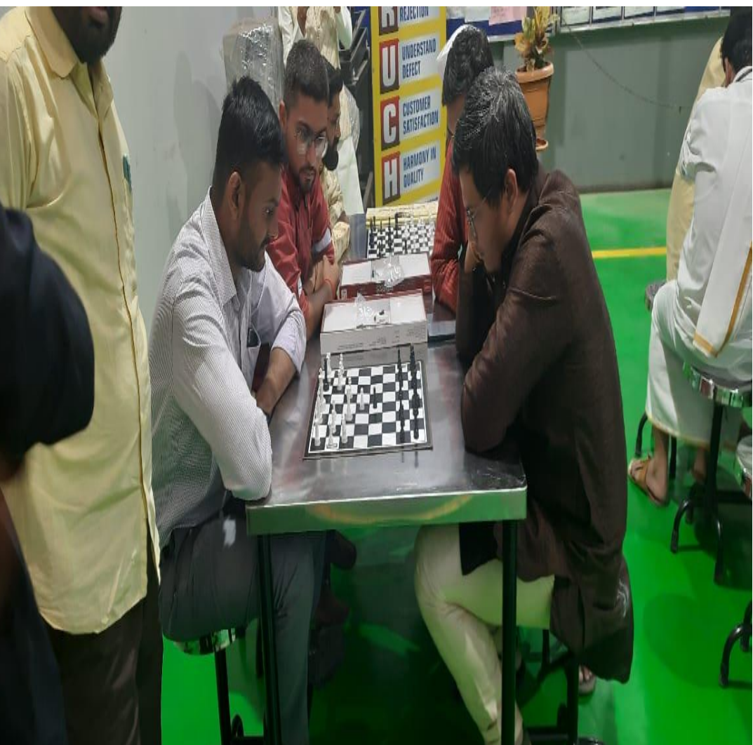
REPL I & VI