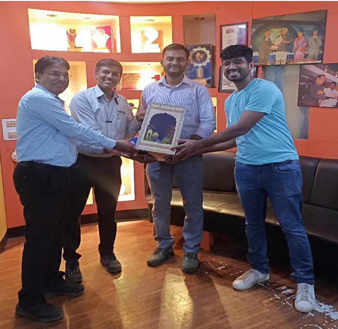
REPL I & VI