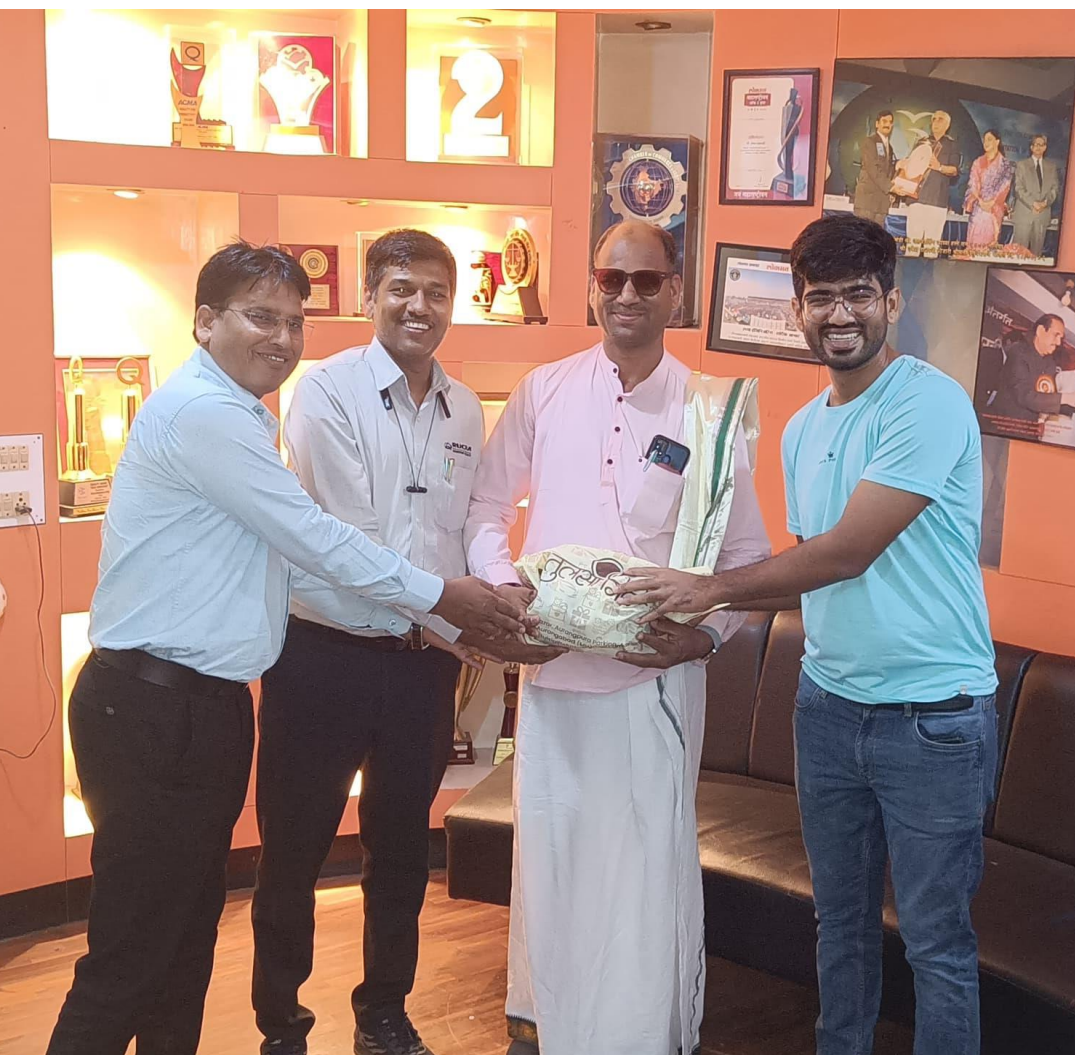
REPL I & VI