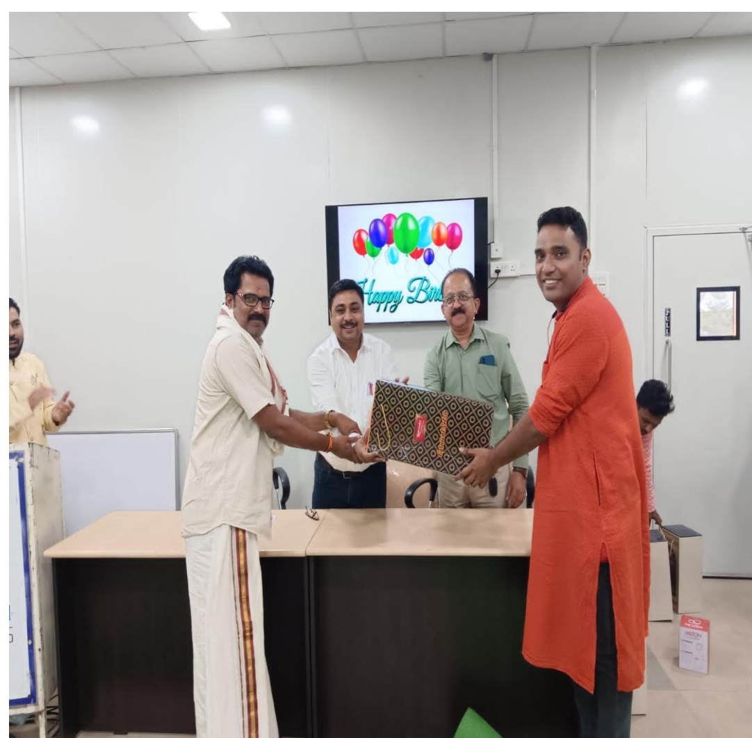
REPL VII & XI