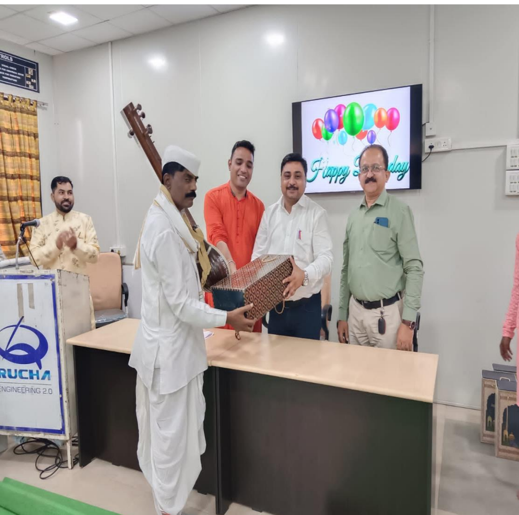
REPL VII & XI