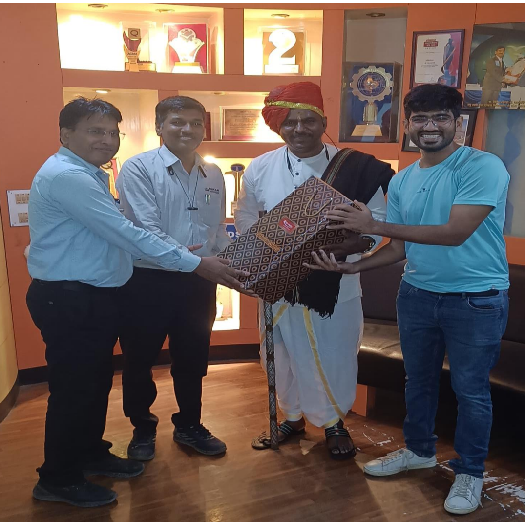
REPL I & VI