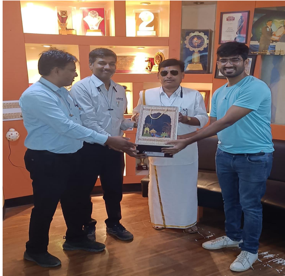
REPL I & VI