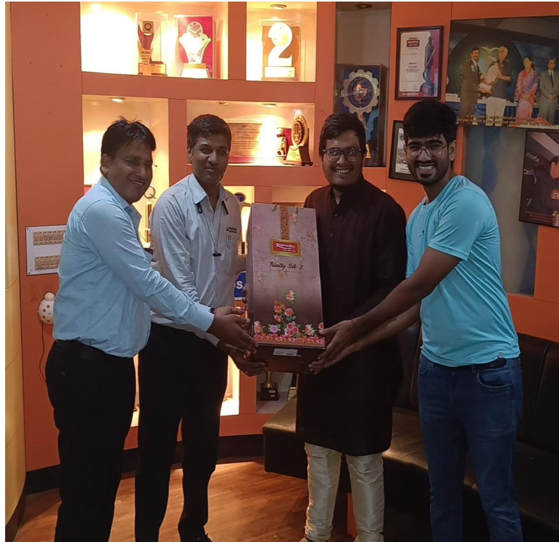
REPL I & VI