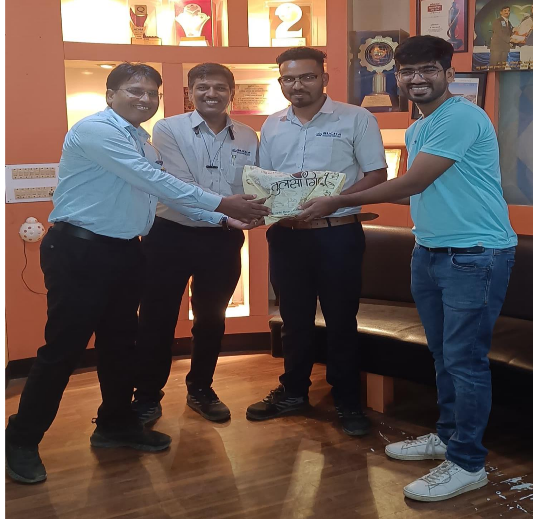
REPL I & VI